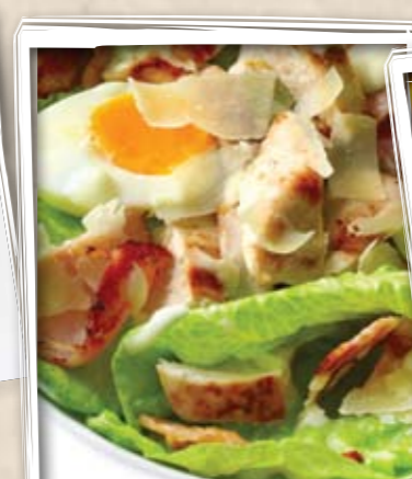
Chicken Caesar Salad